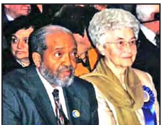
IMAM W. DEEN MOHAMMED SPEAKS ON ABORTION See Page 15