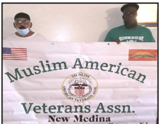
MAVA POSTS PARTICIPATE IN JUNETEENTH 2022 See Page 8